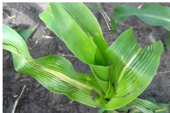
Figure 2: Reflex (fomesafen) herbicide carryover damage in corn plant.

This map represents soil moisture values measured by sensors buried at 5, 20, 50 and 100 cm at 100 sites across Manitoba. Soil properties e.g. bulk density, field capacity & wilting point were estimated for each soil based on their physical characteristics. The amount of available water held by the soil will vary based on soil properties such as texture, organic matter and bulk density. The map is a regional guide that should be supplemented by site-specific considerations for specific local areas, fields and soils.