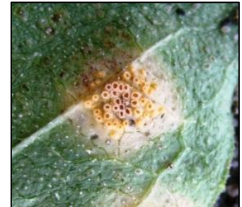
Rust aecia on underside of leaf.

occur on both the upper and undersides of leaves. As the disease progresses, uredinia may be found on the upper leaves, stem and bracts of the sunflower plant. In response to temperature, the uredinia convert to telia (black spots on the upper surface of leaves) at the end of the season which do not rub off and are the overwintering structure.