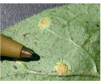
Early Stages - Pycnia (L) and Aecia (R)

This is the earliest visible stage of rust. The bright orange lesion is called pycnia and is found on the upper surface of the leaf. These bright orange lesions are easily spotted and are often surrounded by a yellow halo. This stage rarely appears with the exception of years like 09/10 which saw high local inoculum levels and favorable conditions (free moisture and warm temperatures). Early appearance of rust provides the opportunity for multiple infections throughout the season.