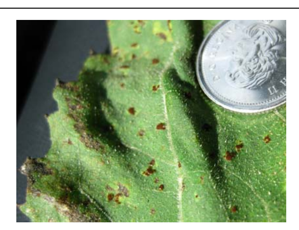
Economical Stage—Uredia (Above)

The most common and recognizable stage of sunflower rust is the uredial stage. This stage appears as cinnamon red/brown pustules which protrude from the leaf surface and rub off. The pustules will generally appear first on the lower leaves and move up that plant as new spores are produced. This is the economical and repeating stage of rust which can cause significant yield losses depending on: