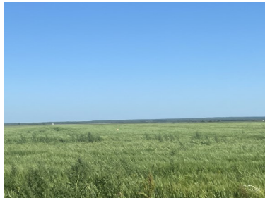
Minimal lodging was observed in plot 5